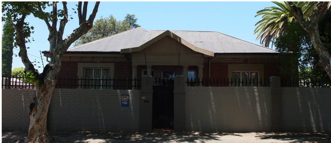
Fig. 203 Single storey residence with corrugated iron roofing and centrally located front stoep, all original design elements are still in a very good condition