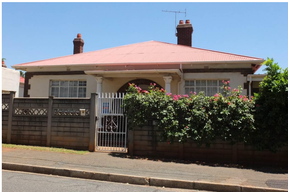
Fig. 183 Single storey residence with corrugated iron roofing and centrally located front stoep covering the arched main entrance, face brick detailing like building edges and arched entrance are still in very good condition