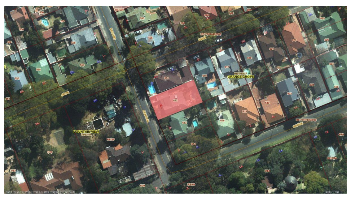
Fig. 120 Stands 612, 613 and 614 are located along the eastern side of Central Road within a residential area of Orange Grove on the border of Mountainview