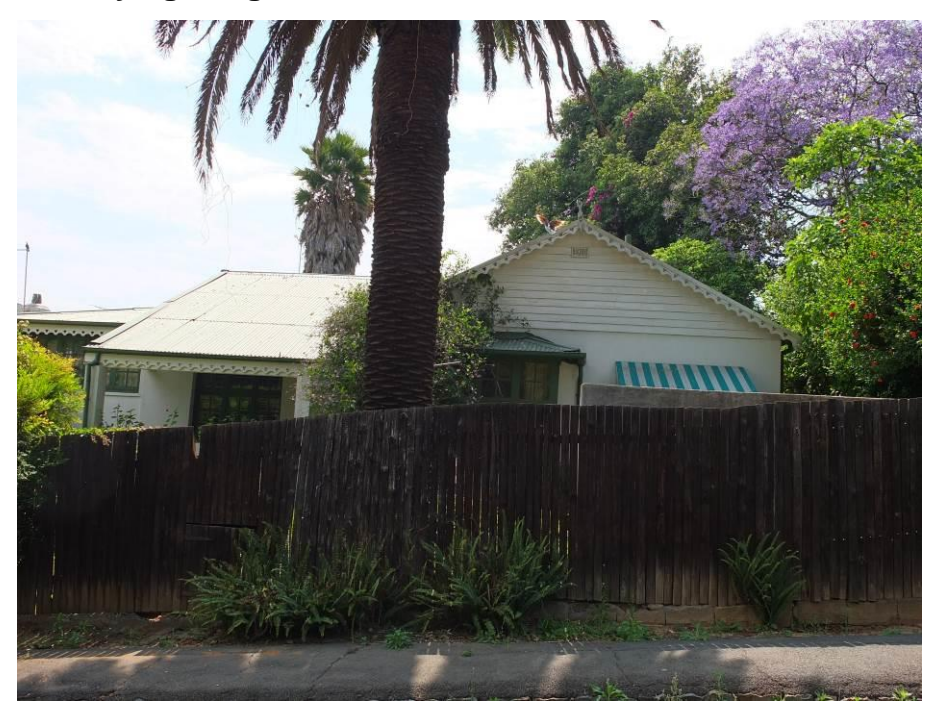
Fig. 123 One sided triangular gable with front stoep and pitched corrugated iron roofing