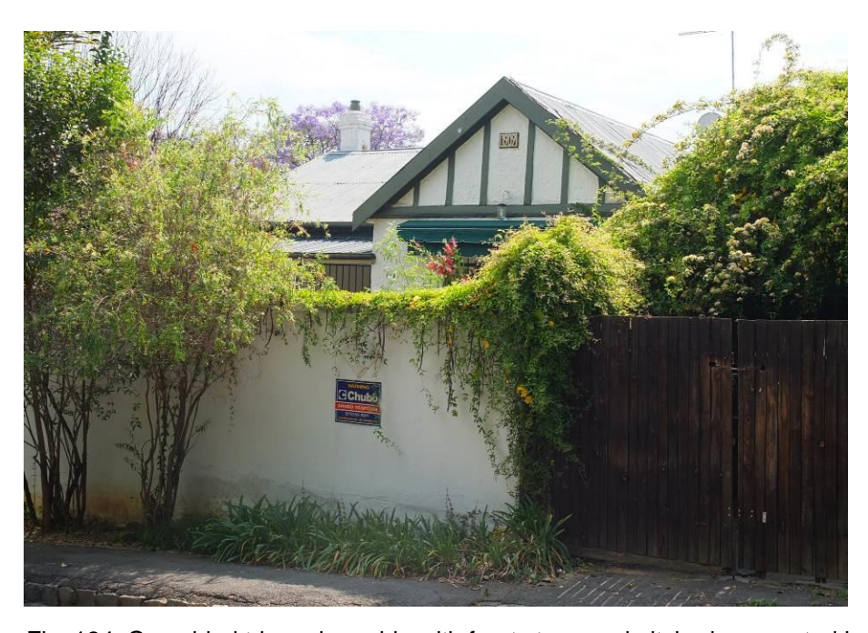
Fig. 124 One sided triangular gable with front stoep and pitched corrugated iron roofing