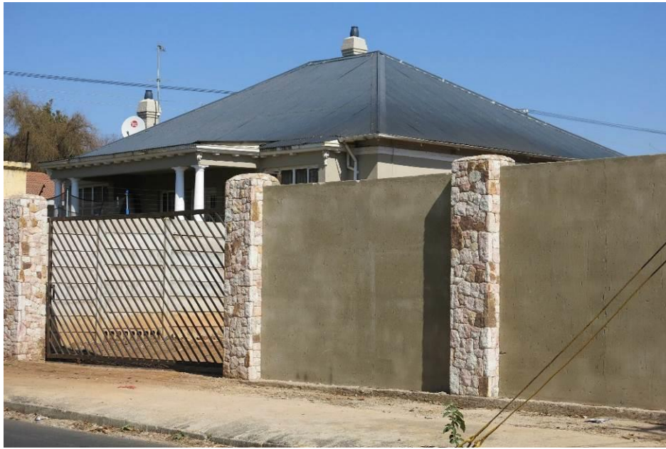
Fig. 169 Good example of single storey corrugated iron roof freestanding residence from 1931 with centrally located stoep and two sets of double columns to support the front stoep