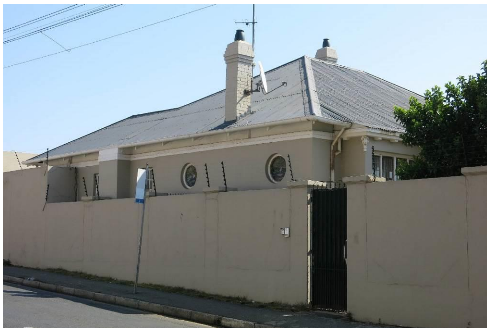
Fig. 170 Corrugated iron roof structure with decorative brick chimneys and rounded windows along the side elevation