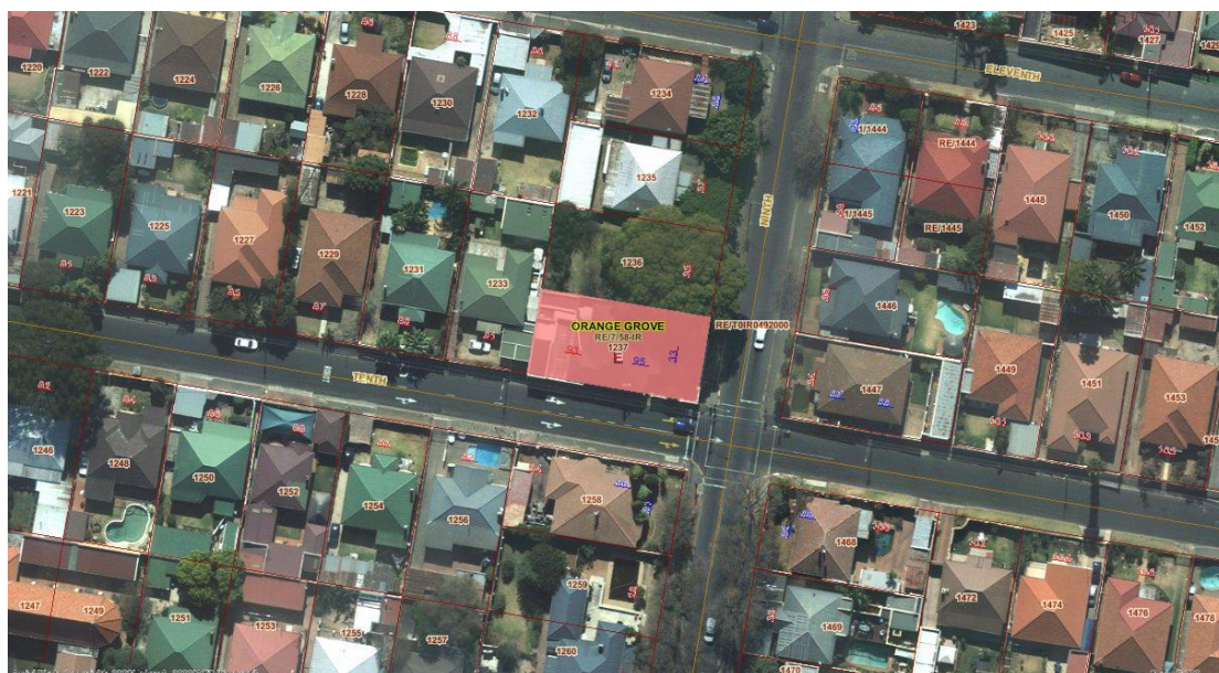
Fig. 167 Stand 1237 is located along the north-western corner of Ninth Avenue and Tenth Street within a residential area in Orange Grove