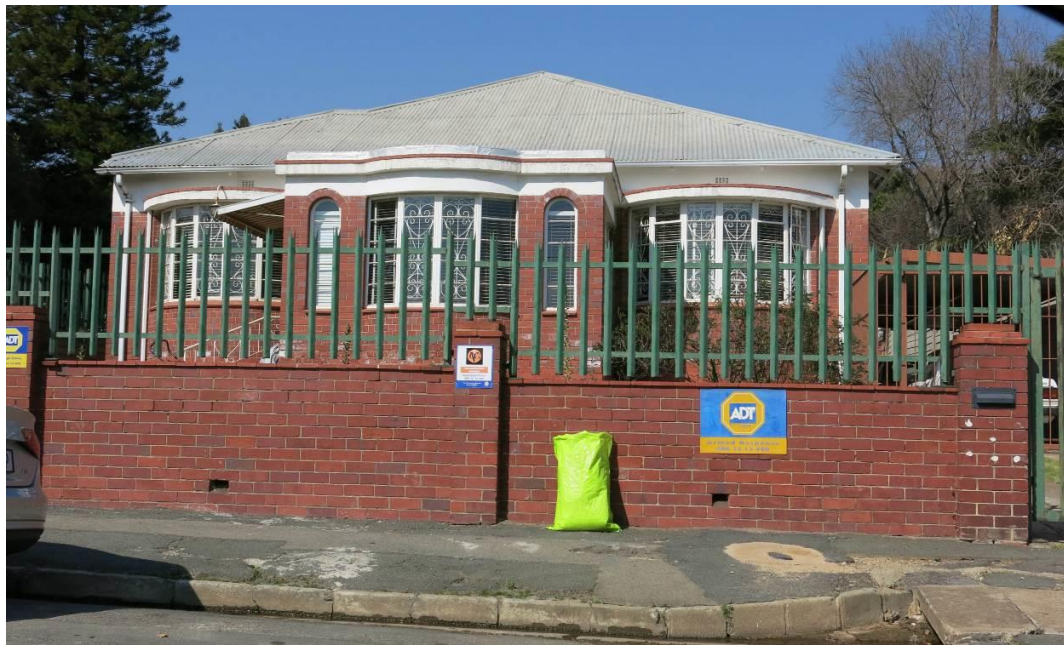
Fig. 150 Good example of single storey corrugated iron roof freestanding residence from the late 1930's with centrally located enclosed front stoep still in original design from J.C. Cook & Cowen, face brick detailing is also still in very good condition