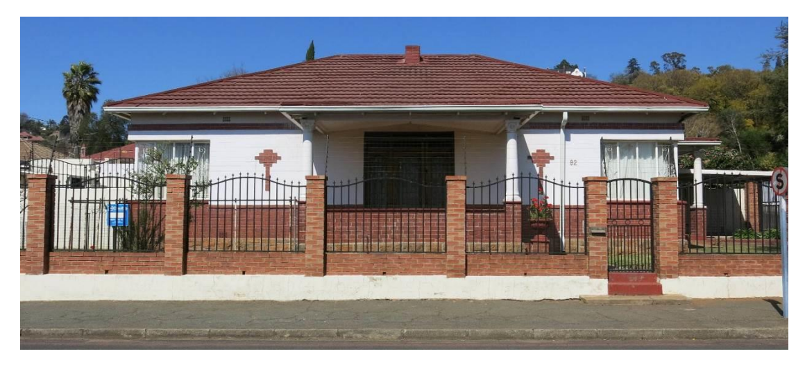
Fig. 138 The tiled roof building shows fine face brick detailing along the façades and corner windows opening the façade to the sides (Source: tsica heritage consultants, 2015)

(Source: tsica heritage consultants, 2015)