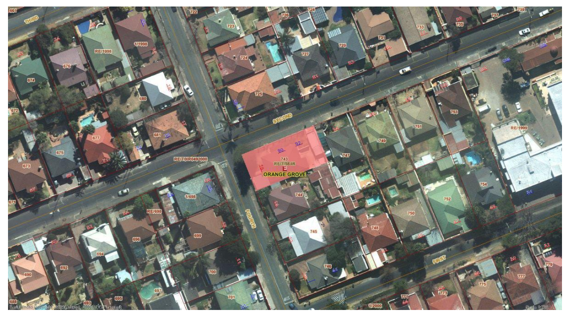
Fig. 135 Stand 743 is located along the southern side of Second Street on the south-eastern corner of Second Street and Fourth Avenue within a residential area of Orange Grove

Monika Läuferts le Roux & Judith Muindisi, tsica heritage consultants Office: 5<sup>th</sup> Avenue, 41 – Westdene – 2092 – Johannesburg; Tel: 011 477-8821 tsica.culturalheritage@gmail.com