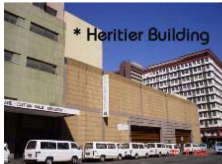
Top left: corner Jeppe and Rissik Streets.