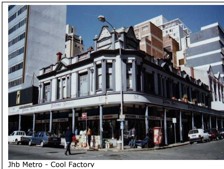
Jhb Metro - Cool Factory

Previous/alternative name/s : Champion Chambers (reference of 1920)