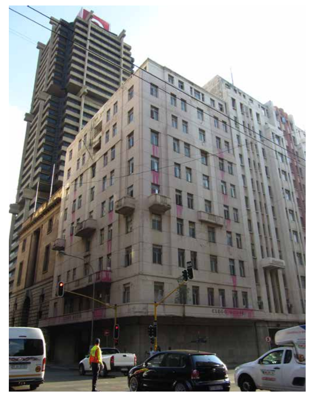
Contemporary image of Clegg House.