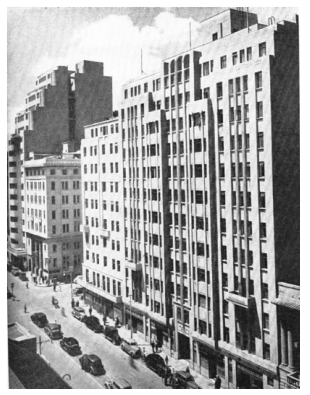
Image of Clegg House, circa 1950s - Bruwer, J. J. (2009), Clegg House (BB-3).

Designed to stand on a prominent corner, Clegg House is a reinforced concrete frame structure with plastered brick infill panels and steel frame windows. The building comprises a Basement, Ground Floor Shops (now parking), and nine floors of office accommodation above, with a flat concrete roof and Servants' Quarters. Notable features of the original design by Moffat and Harvey included projecting plastered brick balconies supported by ornate brackets to the Third and Fifth Floors.