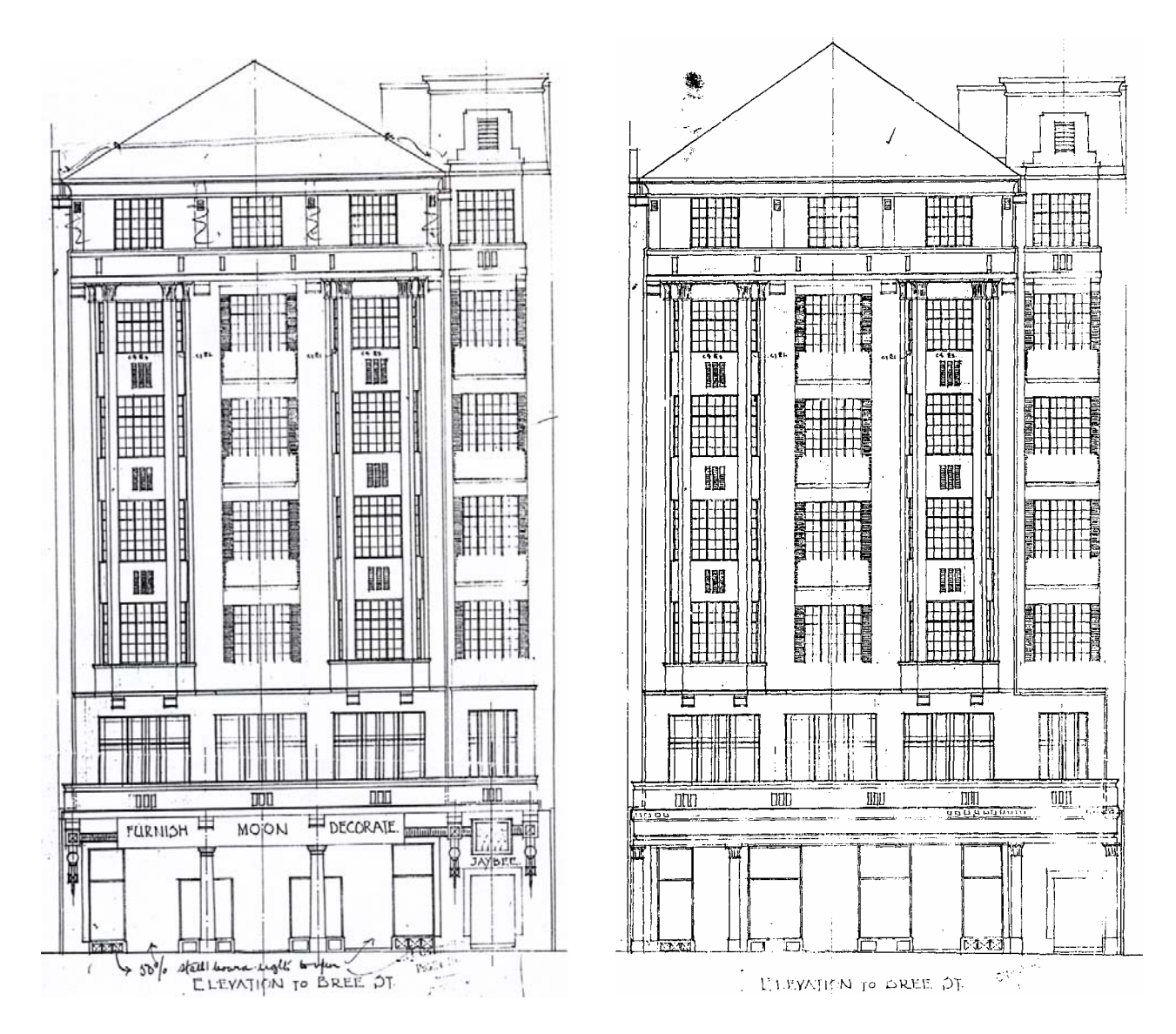
Top left and right: extracts from two different municipal submission drawings, showing the Bree Street elevation of the proposed building. Both drawings are dated March 1929. The drawing on the left was signed on 23 March 1929 and the one on the right, on 8 May 1929, by the City Engineer.. As no other elevation plan could be found, it remains difficult to confirm which of these elevation plans was eventually implemented.

The original owners first contemplated erecting a ten-storey building exceeding the 100 feet height restriction. James C. Cook, the architect placed the necessary advertisements in the Star (See GENERAL NOTES, letter 25th January 1929 and copy of newspaper clipping). The set of plans mentioned in the letter does however, not form part of the extant plans record of the building. Although these plans were submitted (their receipt on 19 January 1929 was acknowledged on the completed Application for Approval of Plans form), there is no indication that they were ever approved. See GENERAL NOTES for copies of letters dated 15 April and 4 May 1929). The design was abandoned, resulting in the development of new drawings, including elevation plans.