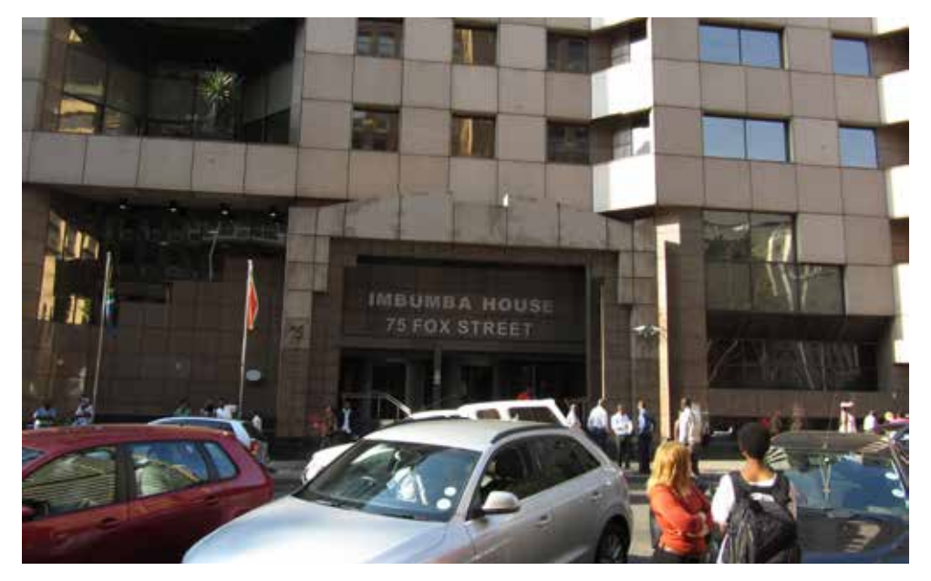
Contemporary Fox Street entrance.