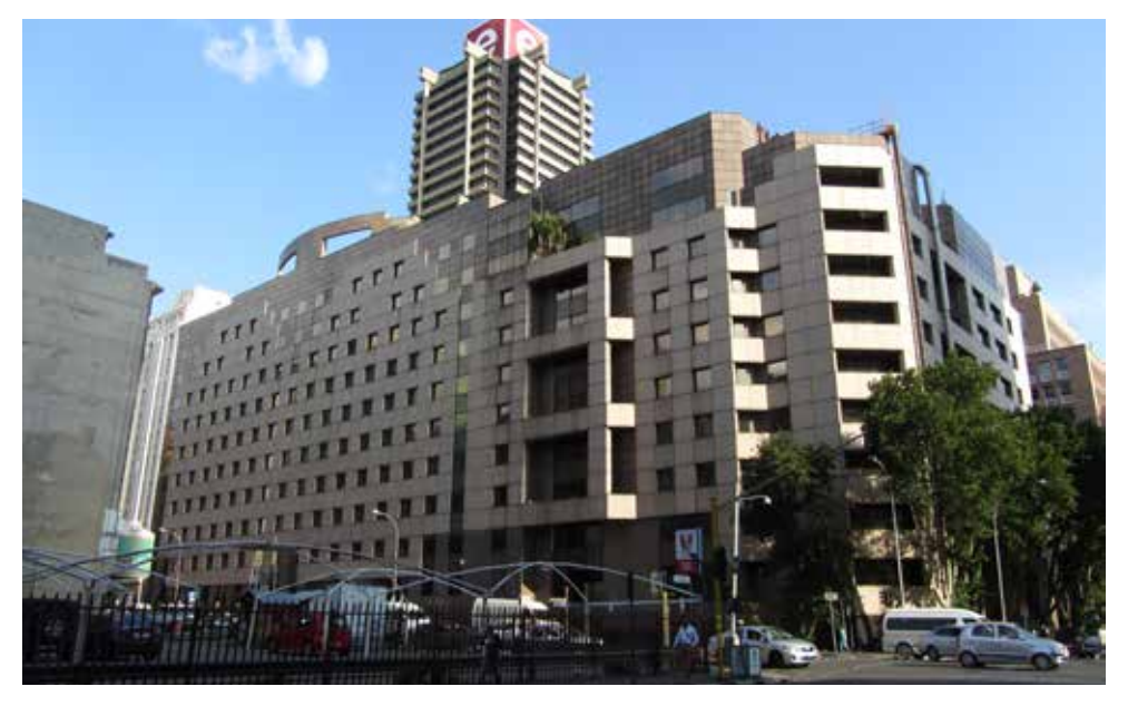
Contemporary image - exterior facade.

In 1988 Gold Fields closed its operations at 75 Fox Street, an address which it had occupied for more than 100 years. The declining fortunes of the gold mining industry saw the company unbundled to BHP Billiton and the building disposed of on the open market.