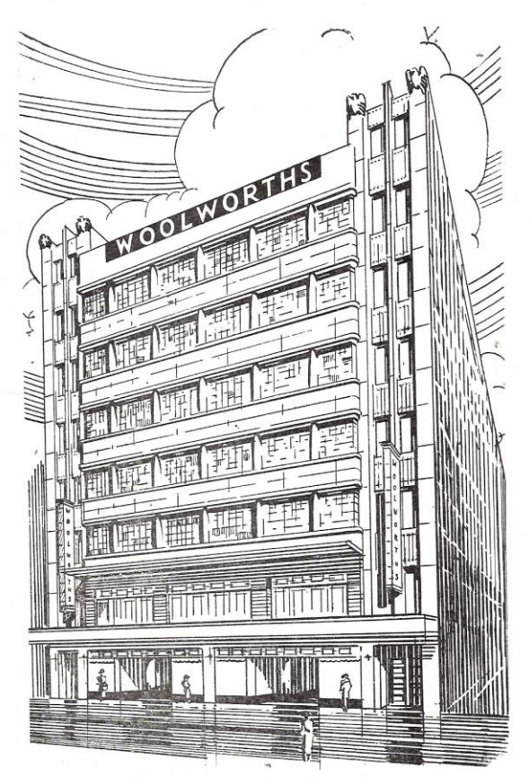
Woolworths, Kerk Street, extending into Eloff Street, Johannesburg Branches throughout South Africa

In congratulating the city on reaching its 70th Birthday we congratulate ourselves on our good fortune in having been established in the city for a considerable part of that period.