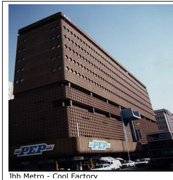
1hh Metro - Cool Factory

Previous/alternative name/s : Edgars Building