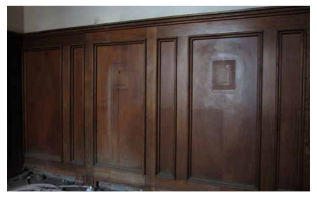
Contemporary image - interior panelling on upper floor.