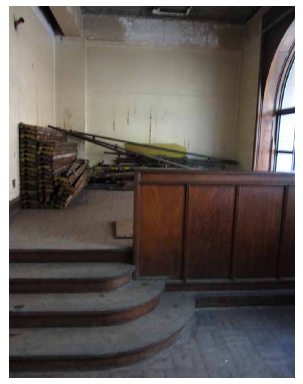
Contemporary image - interior of Ground Floor.