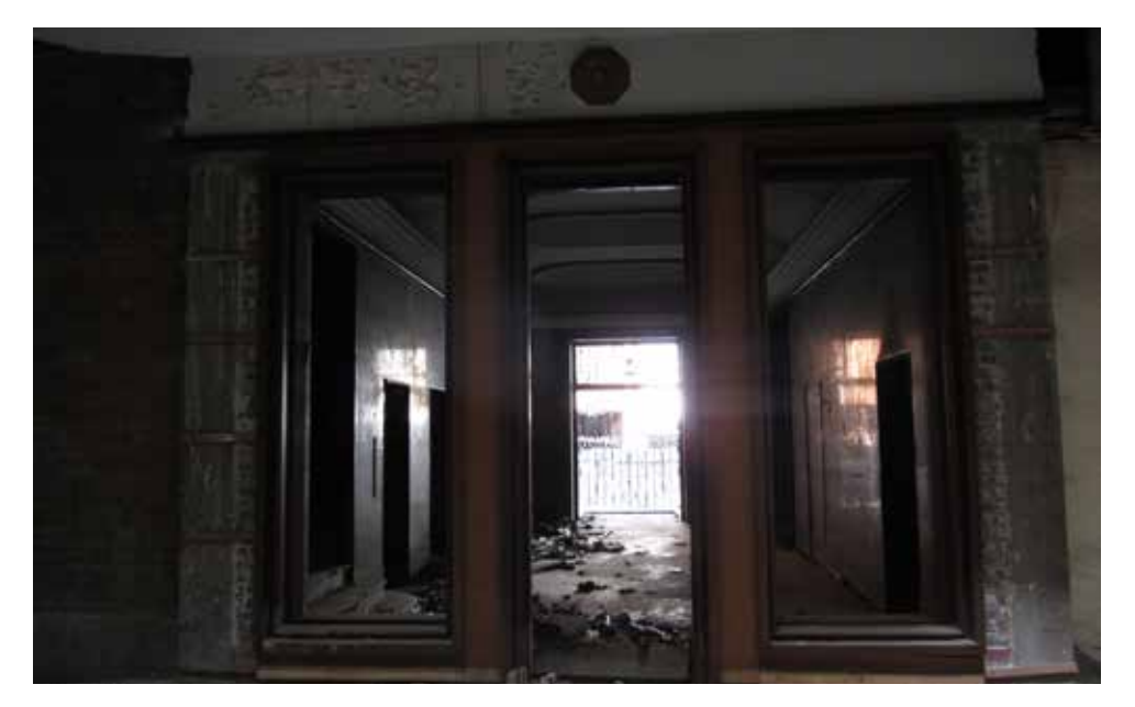
Contemporary image - doors to lift lobby.