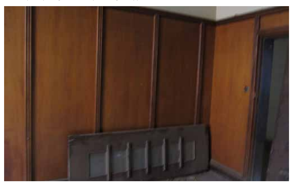
Contemporary image - interior panelling on upper floor.