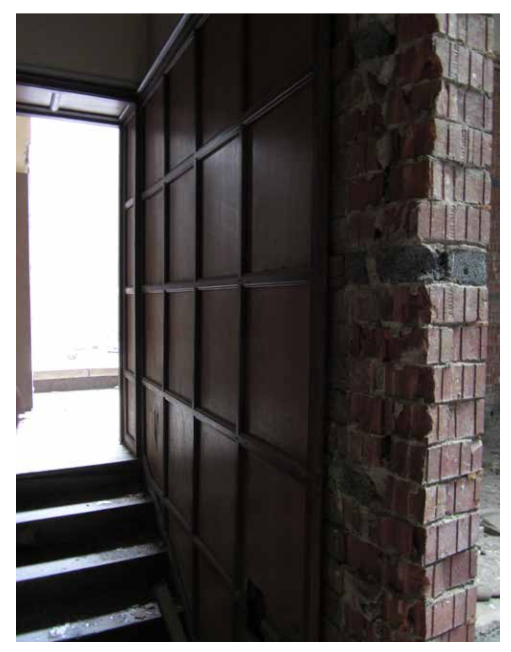
Contemporary image - interior of Ground Floor.