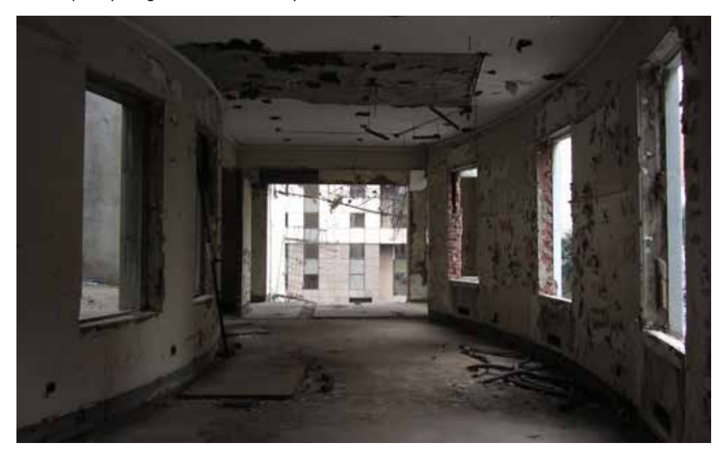
Contemporary image - interior / outer area of chamber room.