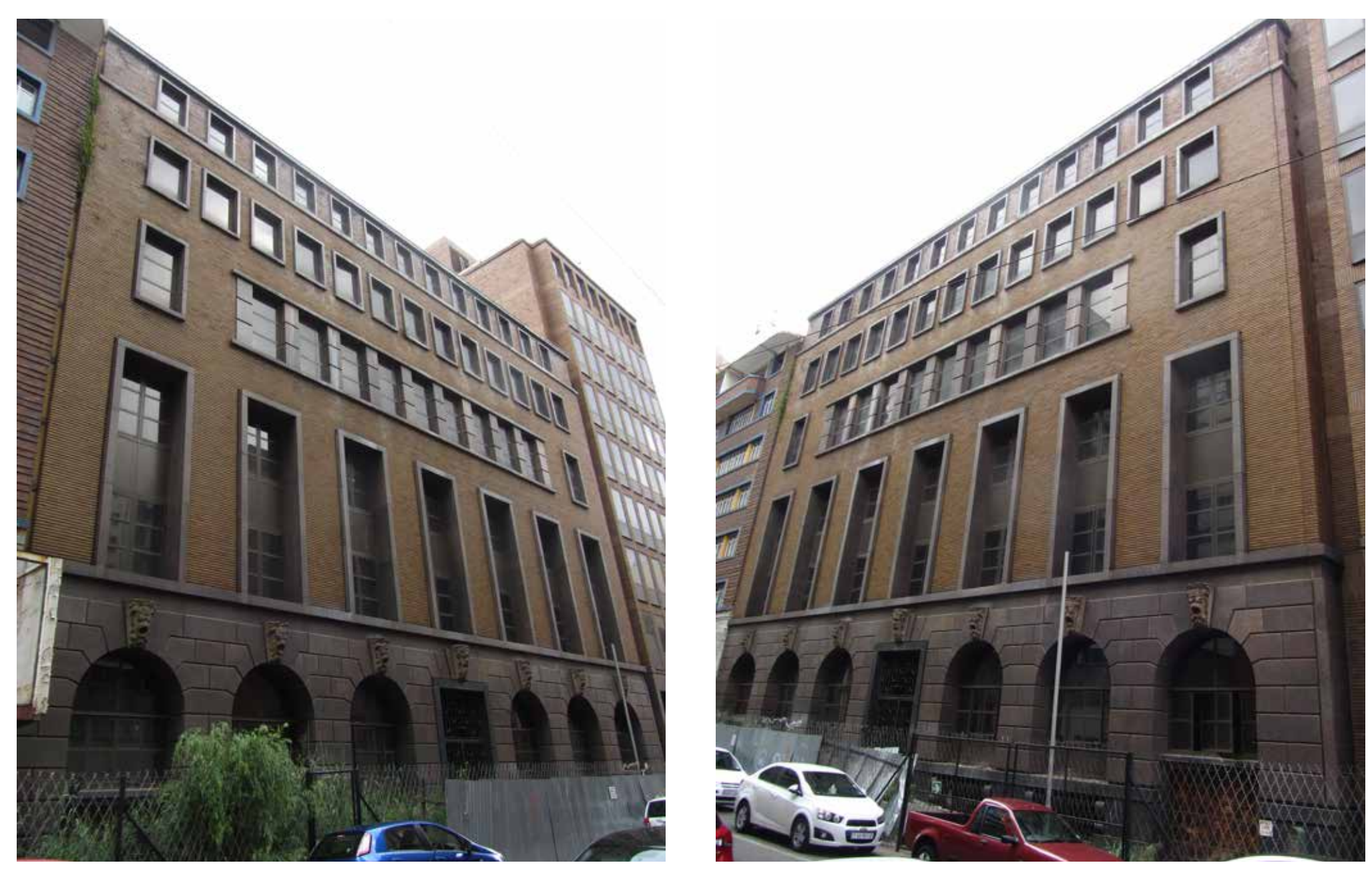
Contemporary image - facade.