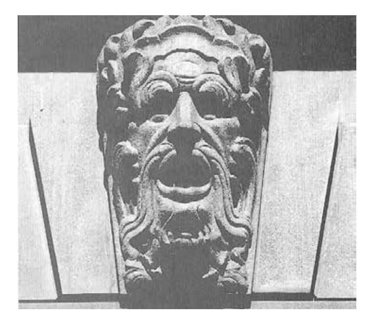
Detail of keystone - Chipkin, C. M. (1993), page 139.