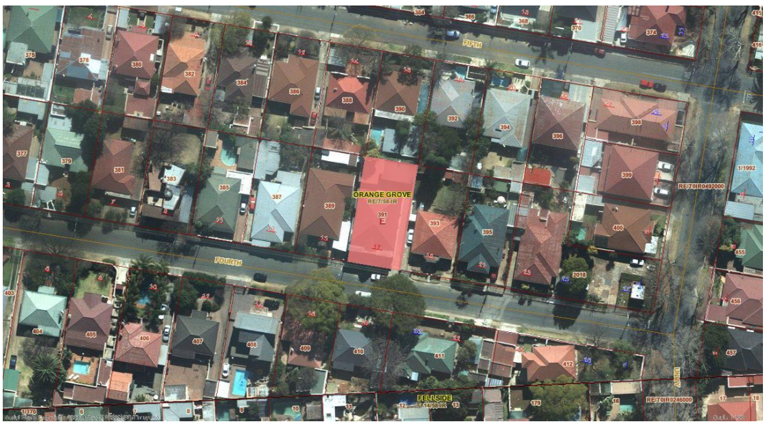
Fig. 142 Stand 391 is located along the northern side of Fourth Street in the south-western corner of Orange Grove within a residential area