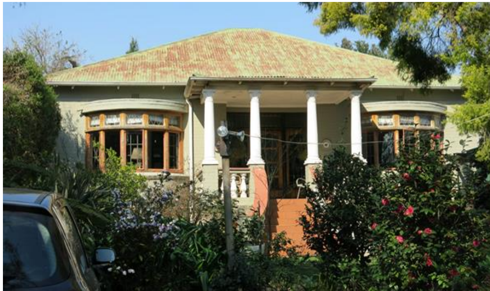
Fig. 153 Good example of single storey corrugated iron roof freestanding residence from around 1930's with centrally located front stoep, front stoep is supported by Ionic columns and rounded off wooden bay windows on either side of the front stoep