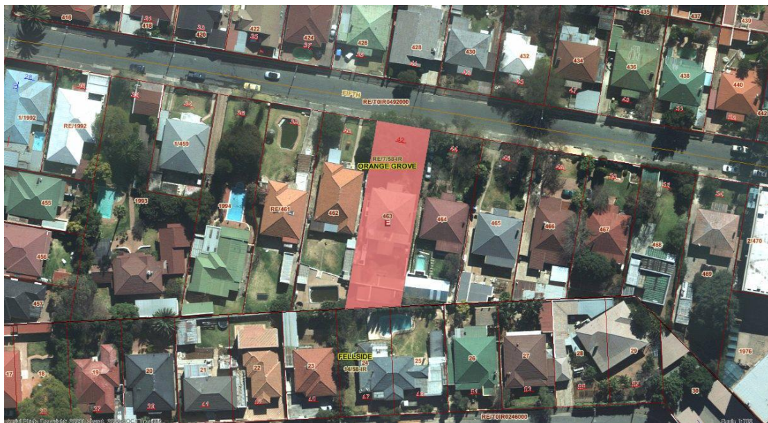
Fig. 151 Stand 463 is located along the southern side of Fifth Street within a residential area in Orange Grove