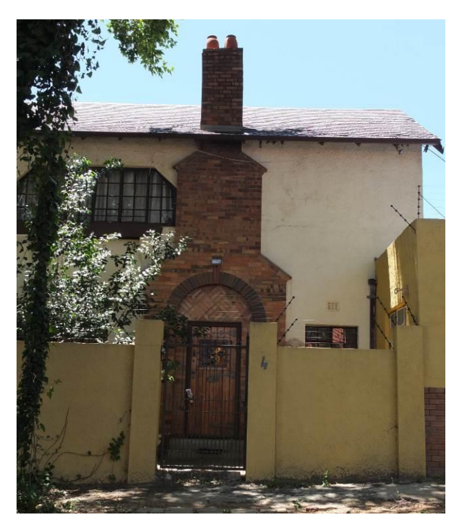
Fig. 187 Main entrance area with face brick decoration and chimney above along Unity Street (Source: tsica heritage consultants, 2015)

(Source: tsica heritage consultants, 2015)