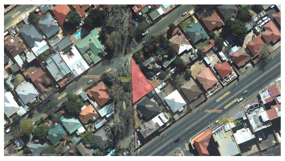
Fig. 184 Stand 125 is located north-eastern side of Louis Botha Avenue and East of Unity Street within the residential area of Fellside