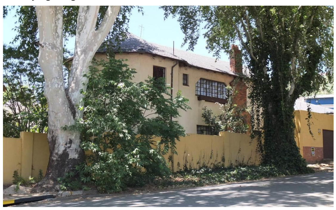
Fig. 186 Double storey slate tiled roofed residence in close proximity to Louis Botha Avenue in Fellside