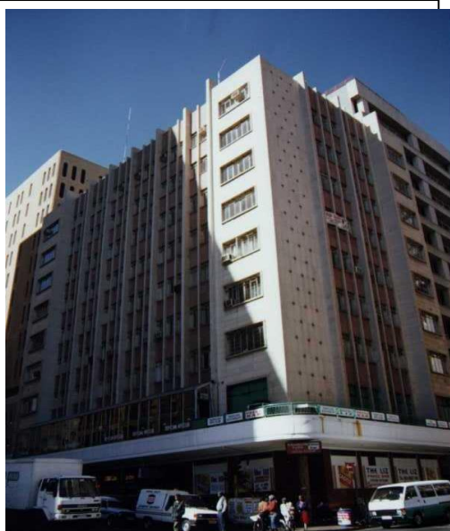
Jhb Metro - Cool Factory

NAME OF PLACE: Elizabeth House and Hotel