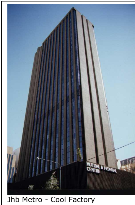
Jhb Metro - Cool Factory