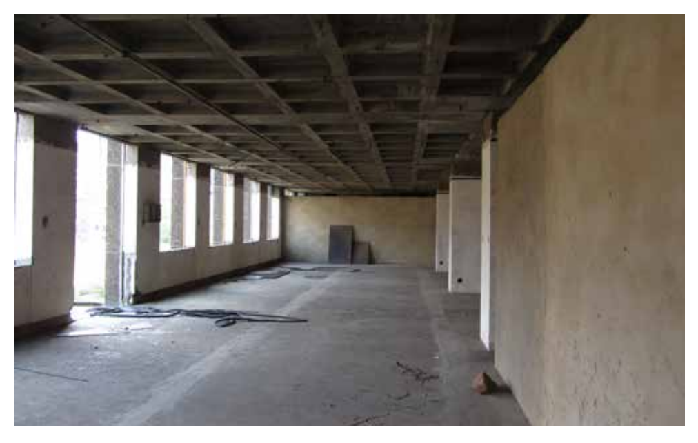
Contemporary image - interior of upper floor.