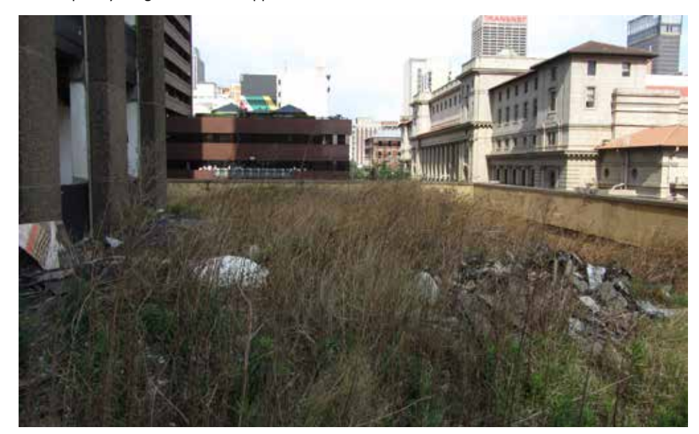
Contemporary image - balcony overlooking Beyers Naude Square.