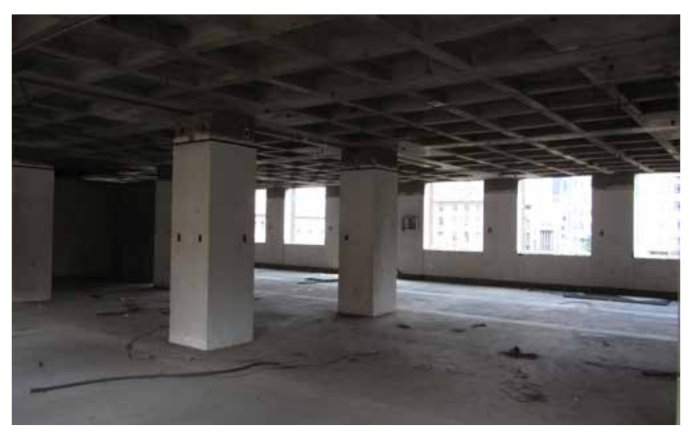
Current image - interior of upper floor.