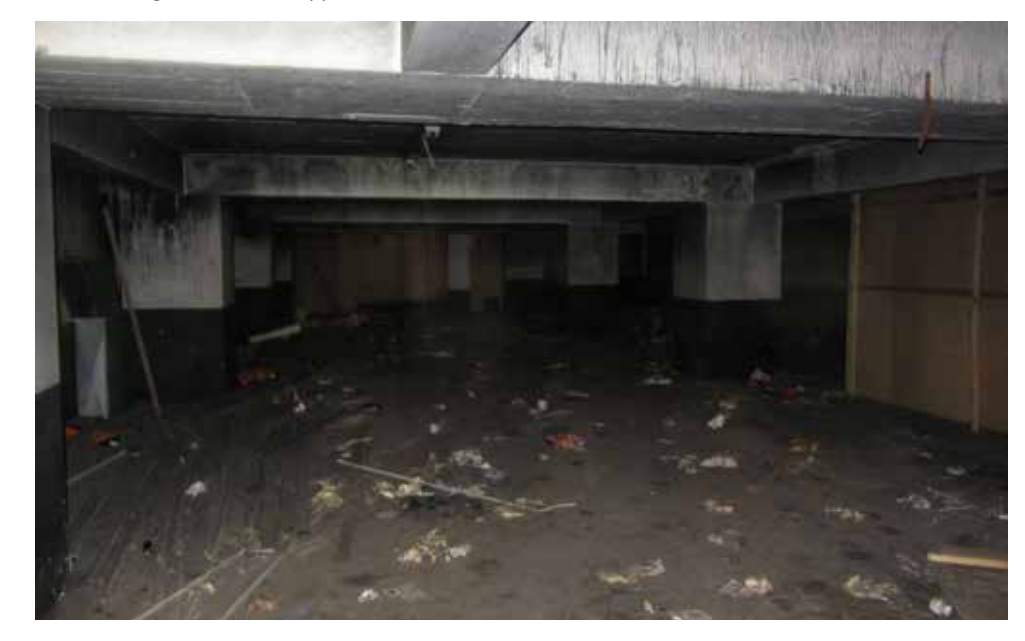
Contemporary image - interior of parking area.