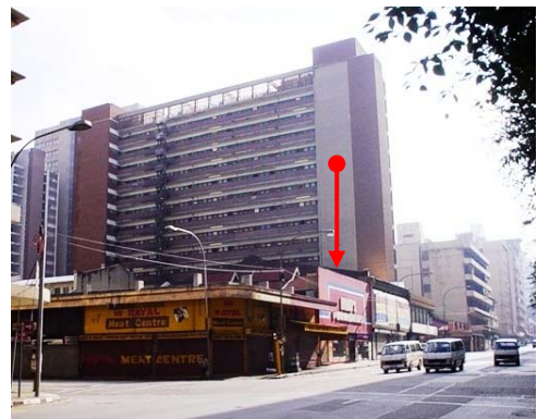
Above: nearest to the camera is the Royal Meat Centre Building located at the northeastern corner of Jeppe and Simmonds Streets.

Previous/alternative name/s : by 1998: Brad's Furnishers