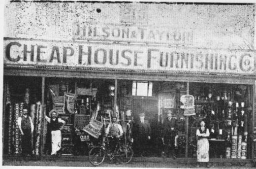
The picture shows a branch in the early days.

In 1886 Johannesburg was but a rough, boisterous mining camp — a magnet to those fired with the spirit of adventure. Among the early arrivals was a young man determined to make his way in the world. He had trudged through the deep powdery dust of the Witwatersrand and pulled up at the door of a pioneer wood-and-iron house. The burly gentleman who appeared at the door enquired of the young stripling, "Well, son, what can I do for you?" "I'm looking for a room," the youngster replied, "and I hear you have a spare one." "That I have, son. Come right in."