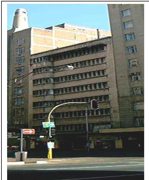
Jhb Metro - Cool Factory