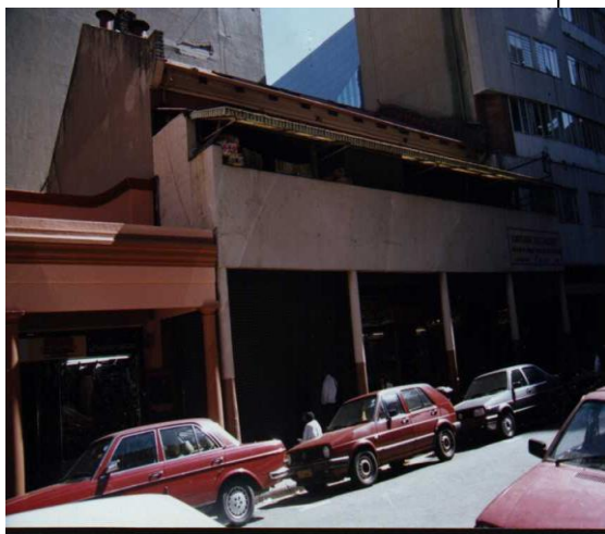
Jhb Metro - Cool Factory