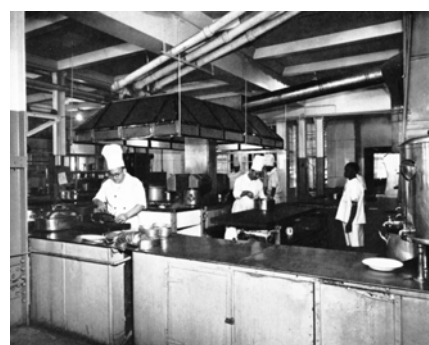
Right: Photograph taken inside the kitchen of the Kitchen Building , from The Rand Club 1887 - 1957 .