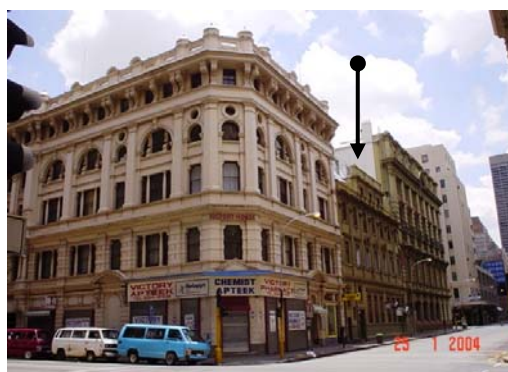
Left: view of main elevation, Fox Street.