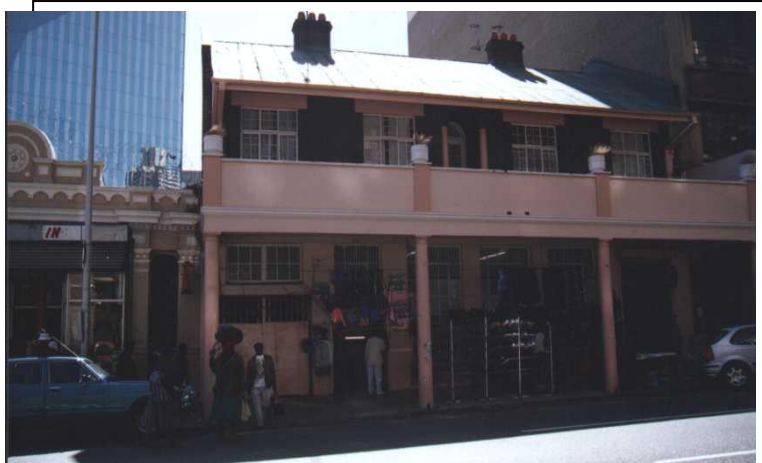
o Metro - Cool Factory