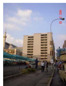
Top left: First Card House, 1998.