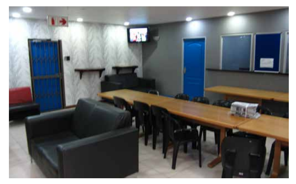
Contemporary image - interior of building.