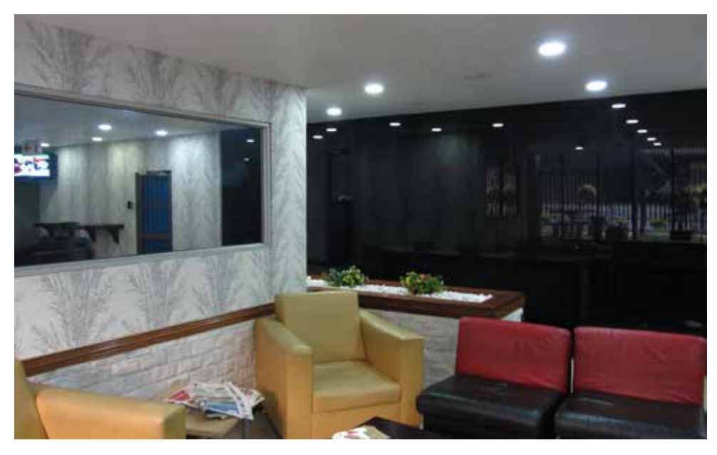
Contemporary image - interior of building.