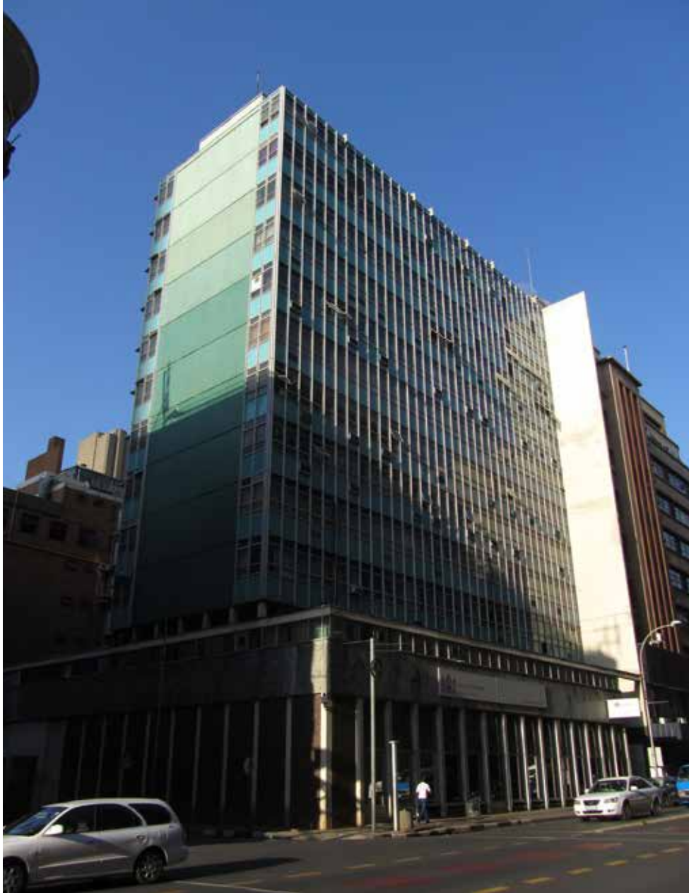
Contemporary image - exterior of Thusanong.

Gauteng Provincial Government Precinct, Johannesburg, Gauteng - Heritage Guidelines for Interested and Affected Parties - July 2017.