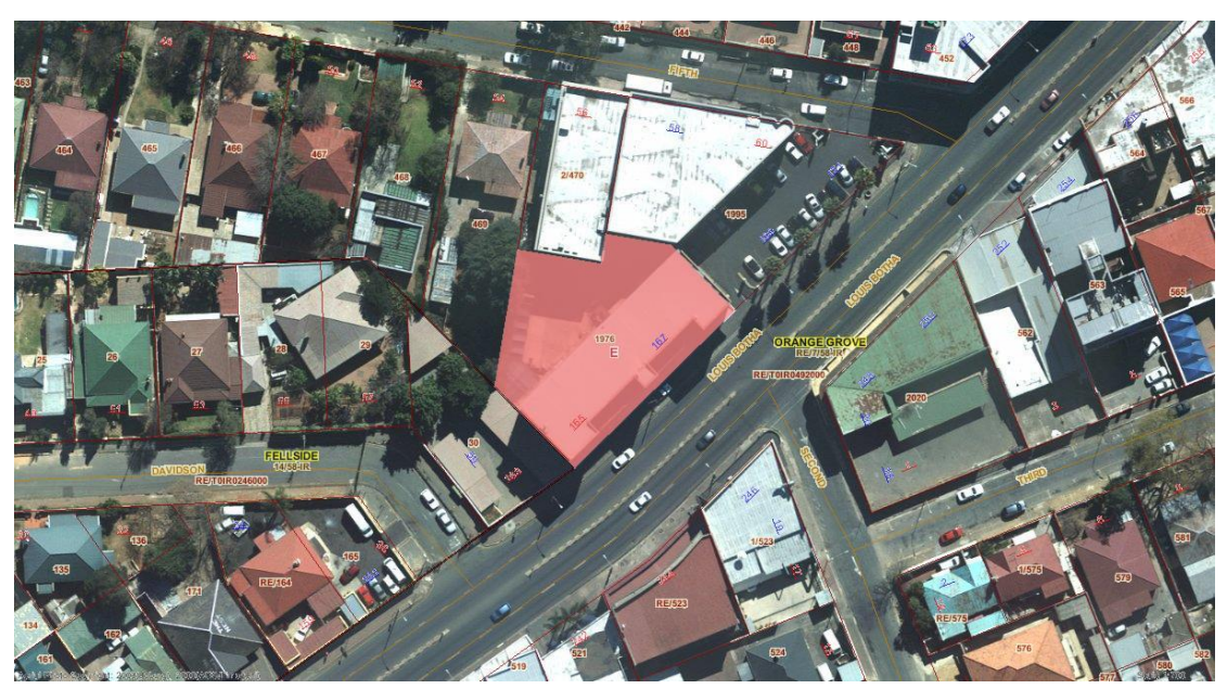
Fig. 31 Stand 1976 is located on the north-western side of Louis Botha Avenue