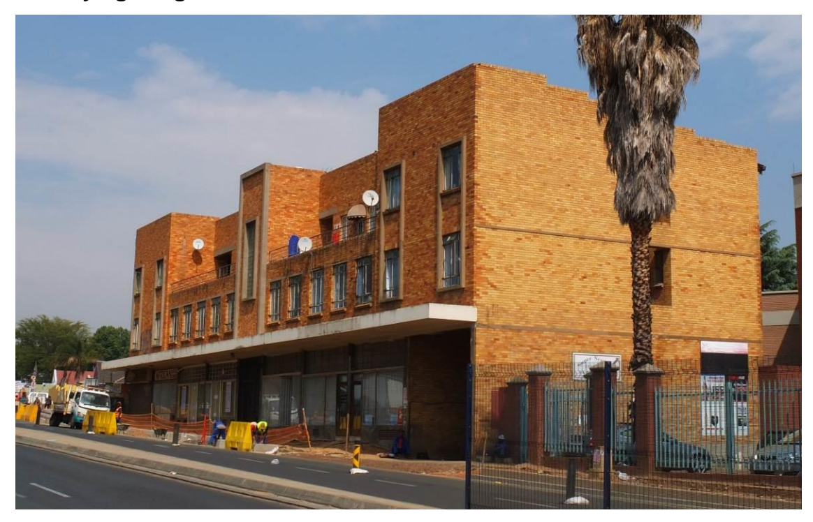
Fig. 33 Three storey commercial mixed-use building block along the western side of Louis Botha Avenue